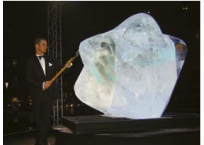
> Enormous diamonds made from Torne River ice to coincide with the Mont Blanc event. 2006.