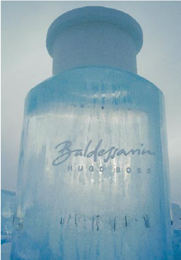
> Hugo Boss launches a new scent at ICEHOTEL. 2002.

The ice illustrates time that has stood still, held its breath and waited. The ice is not in a hurry: it seeks to communicate stillness, calm and silence. In an age when everything goes too fast, it is soothing to let simplicity prevail. Meet a piece of the Torne River on the road – it could be coming soon to a city near you.