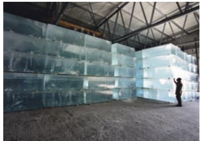
> Ice from the Torne River is harvested in February-March each year and exported to events and bars of ice all over the world.